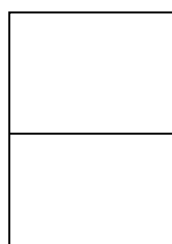
1/2 page JPY30,000