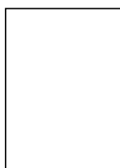
1 page with color JPY100,000